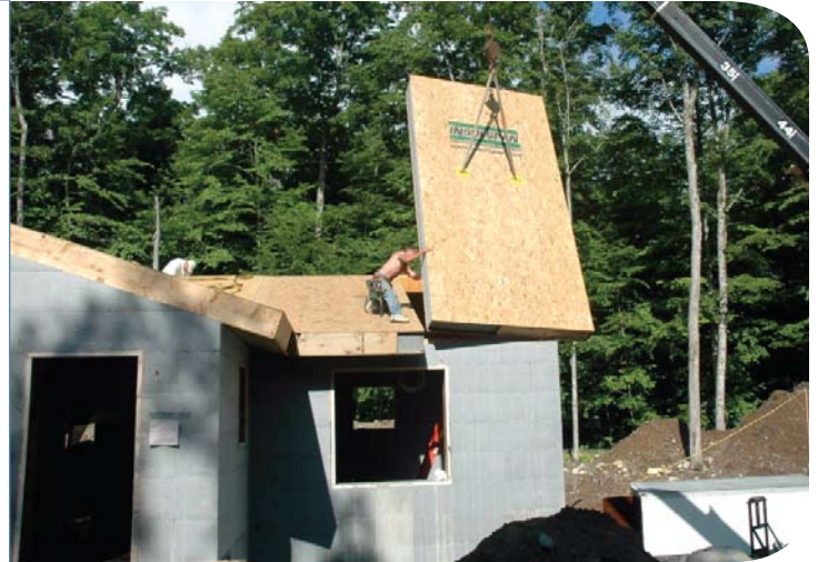
An EPS SIP roof panel is hoisted in place to join the ICF wall section.

lighting. Initial estimate suggest it will cost $200 per year in propane to heat water and run the radiant system in the house. Impressive for a home located in an area where Heating Degree Days approach 9,500 and temperatures dip to 30-40 degrees below zero in the winter. Eventually, Kraft plans to include solar panels on the roof.