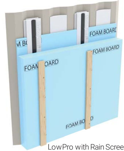
LowPro with Rain Screen