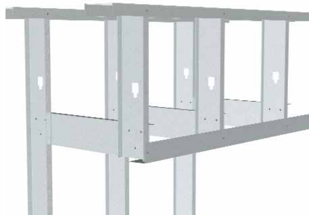
Corner Angle (CA-Series™), Corner Angle (HCN) and 120°/135° (CAEW)